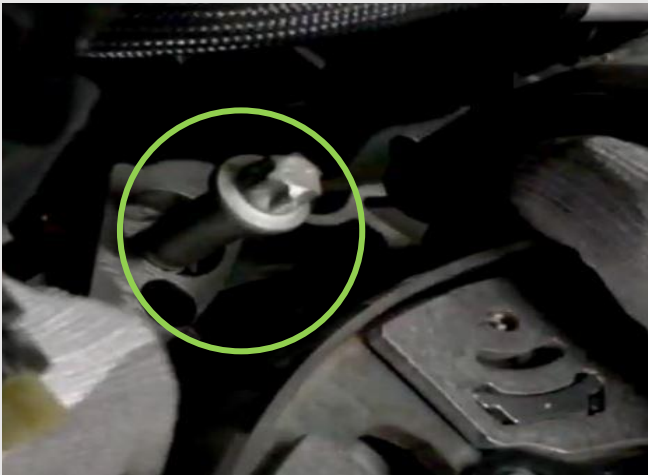
Step 11 Install flywheel blocking tool