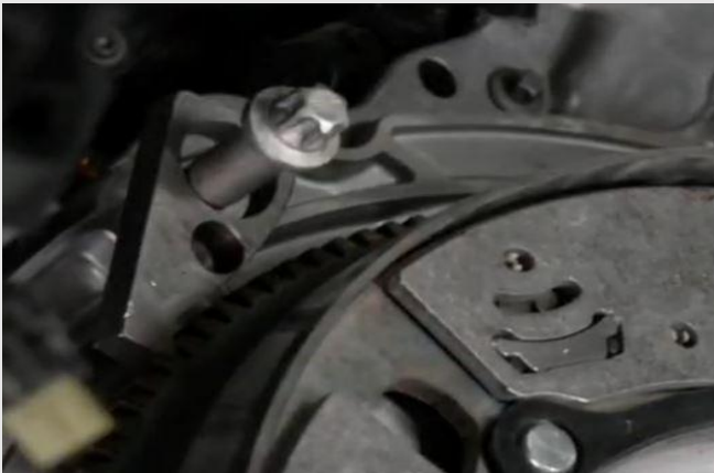
Step 13 Don't forget to remove the flywheel blocking tool