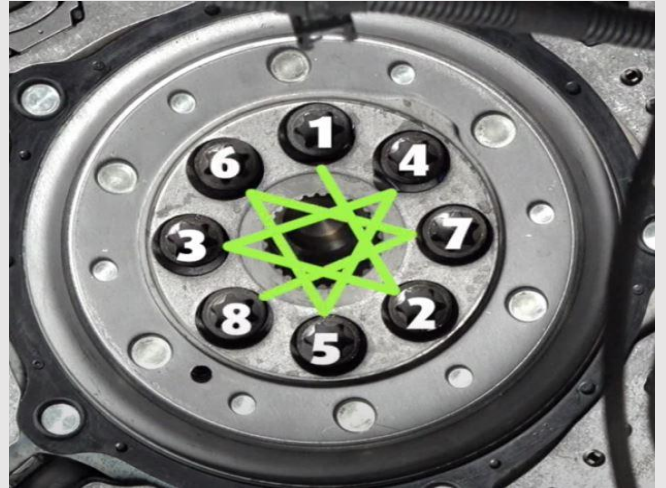
Step 12 Apply torque and tight the bolts in star sequence NEVER use impact tool