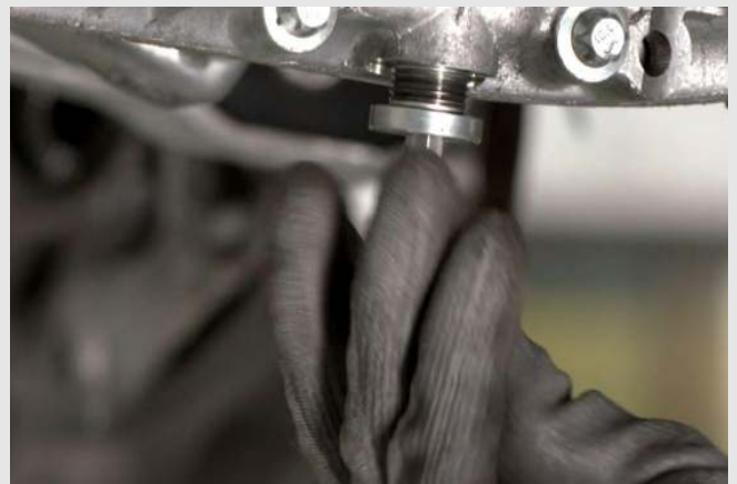
Step 2 Clean & install the oil plug