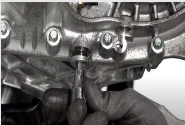
Step 1 Drain the transmission oil