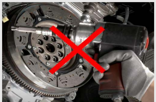
Step 4 Never use impact tool to remove bolts