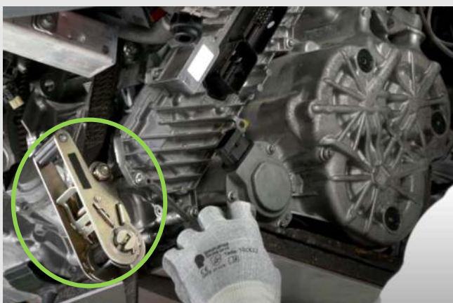
Step 3 To avoid accident, use the correct tool to manage slowly and safely the gearbox from the vehicle